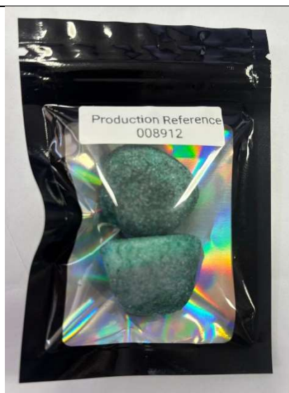
Gummies – Lot No. 008912