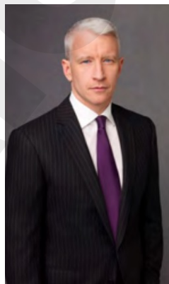
Anderson Cooper: $1.2 MILLION