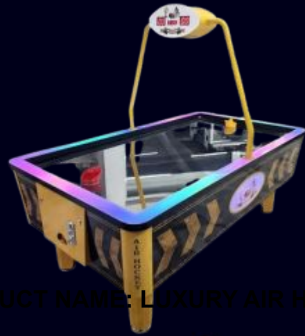
PRODUCT NAME: LUXURY AIR HOCKEY