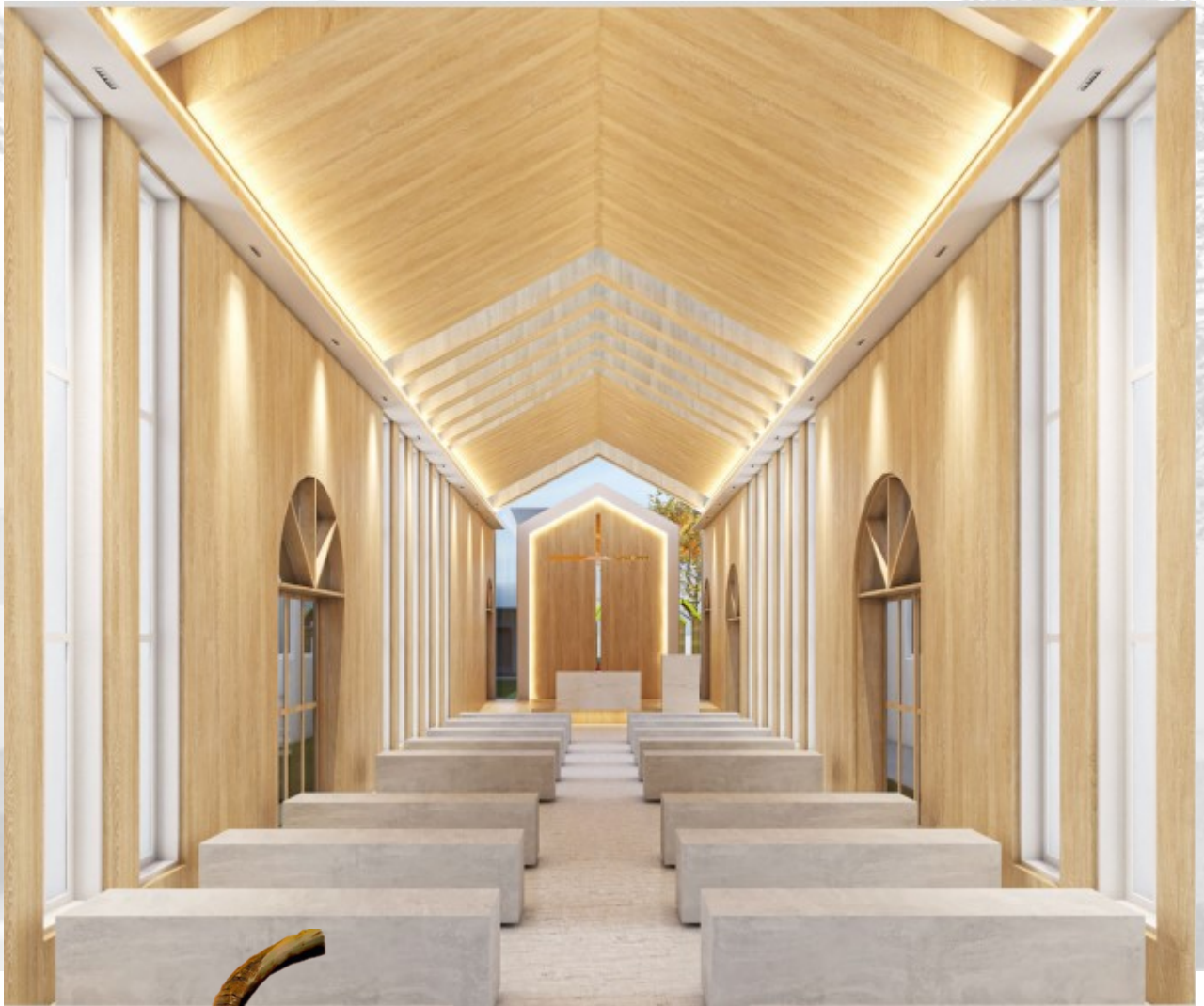
-Proposed School Chapel Interior-