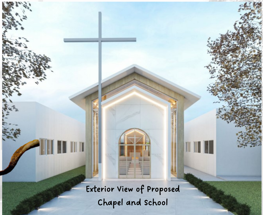
Exterior View of Proposed Chapel and School