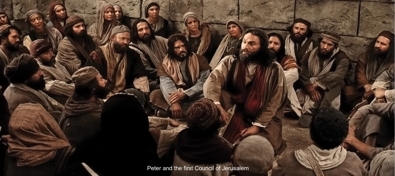
Peter and the first Council of Jerusalem