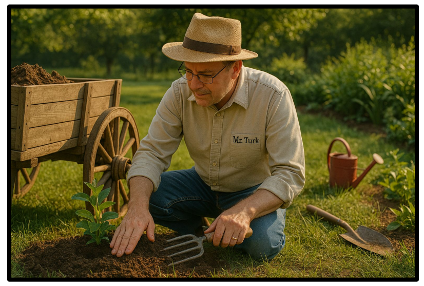
Work the Dirt

"This story is about gardening with Mr. Turk! Help your reader spot -rk and -rt words and read with steady pacing like someone giving step-by-step help."