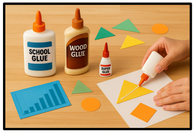
What Is Glue Used For?

"This nonfiction story explains what glue is and how it's used. Look for 'ue' vowel team words like 'glue,' 'blue,' and 'true' as you learn!"