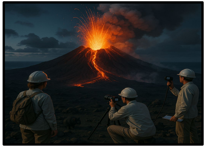
What Is a Volcano?

"This nonfiction story teaches about volcanoes. Watch for 'ou' words like 'shout,' 'loud,' 'out,' and 'ground' as you learn how they work!"