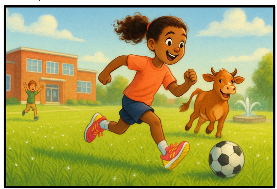
The New Shoes

"This story focuses on the 'ew' vowel team, like in 'new,' 'flew,' and 'dew.' Let's find out how Rue's new shoes helped her shine at school!"