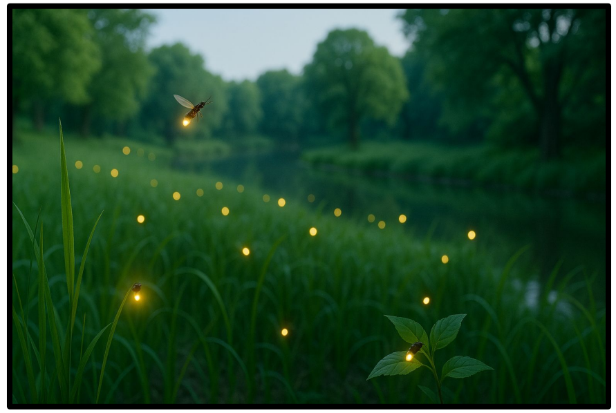
The Life of a Firefly

"This story teaches about fireflies using i-e words like 'rise' and 'shine.' Let's read and discover how they light up the night!"