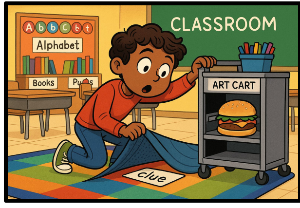
The Burger Clue

"This mystery uses mixed R-controlled vowels like 'burger,' 'corner,' 'Parker,' and 'art cart.' Let's follow the clues and find out who took the lunch!"