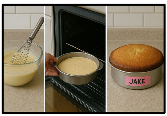
How to Bake a Cake

"This nonfiction story will teach us how to bake a cake using lots of a-e words. Let's practice reading step-by-step directions!"