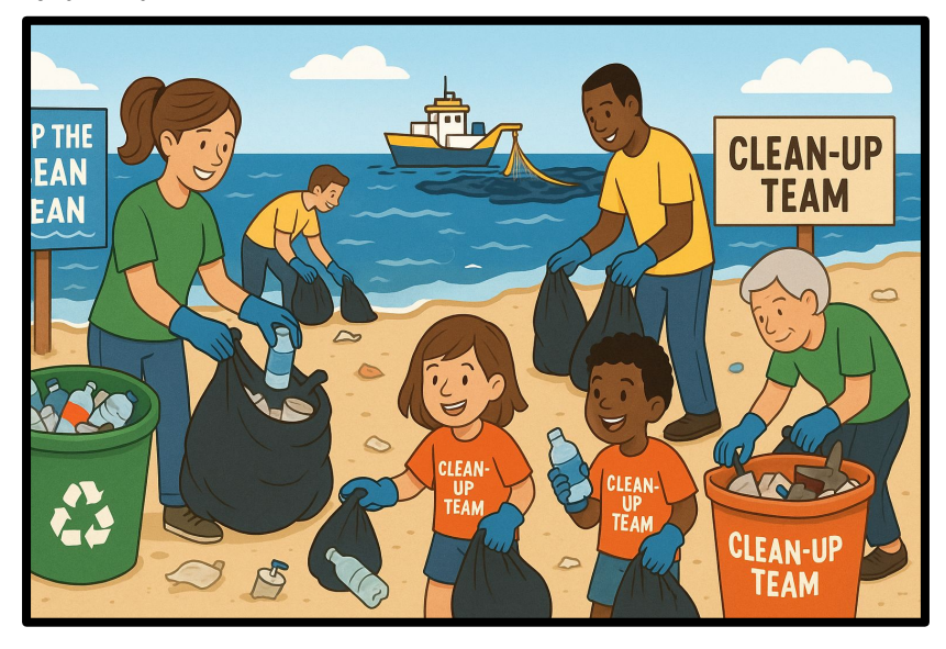
How an Oil Spill Affects the Ocean

"This story focuses on the 'oi' and 'oy' sounds, like in 'oil' and 'joy.' Watch for words like 'spoil,' 'oil,' and 'joy' as you read!"