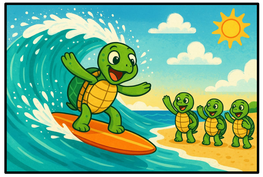
Burt the Turtle's Turn

"This story focuses on the 'ur' pattern, like in 'Burt,' 'surf,' and 'turn.' Let's see how one turtle proves it's his turn to shine!"