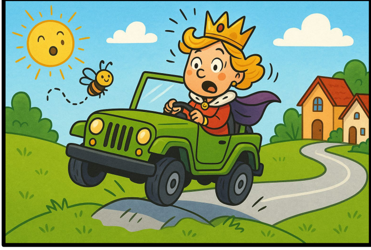
The Queen's Green Jeep

"This story focuses on the 'ee' sound as in 'jeep.' Watch for words like 'queen,' 'green,' and 'speed' as you read!"