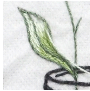
Long & Short Stitch