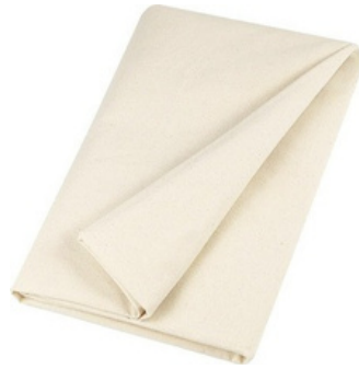
Cotton or Muslin Fabric