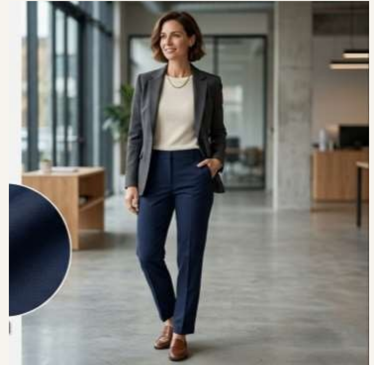
Urban & Workwear

Stretch, moisture-wicking, quick-dry, and lightweight performance fabrics