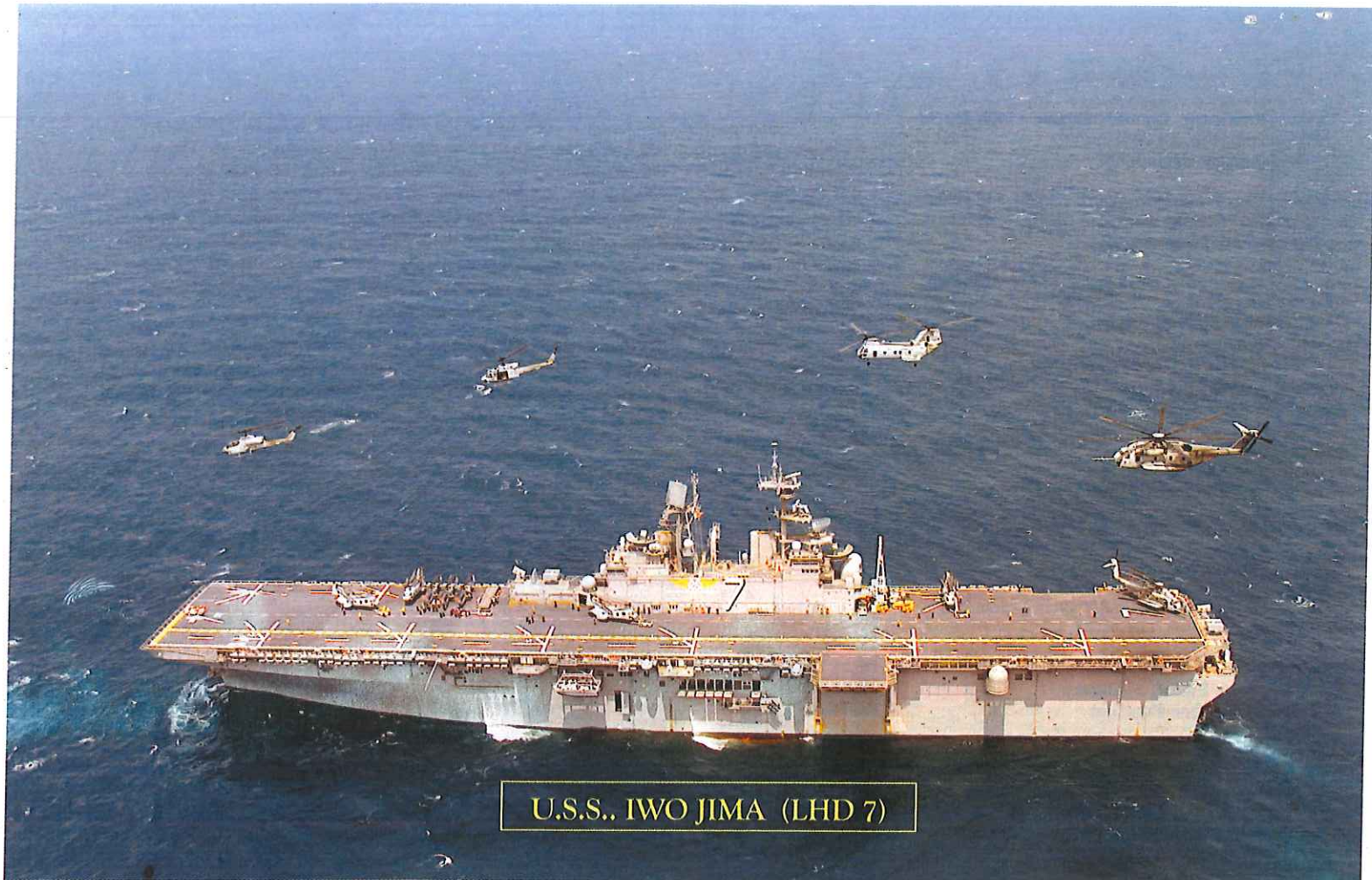
U.S.S. IWO JIMA (LHD 7)

155 th Assault Helicopter Company Association