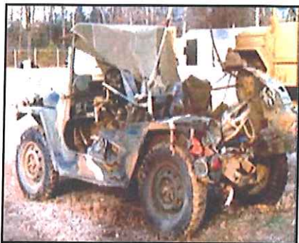
This is not the jeep swapped. The editor is having fun.

The armed platoon shot a lot of rockets and MG ammo. The SF B team troops (from behind the Grand Bungalow) had an extra jeep that had been written off, and we made a swap. One jeep for a bunch of rocket pods. When the cardboard tube in a 7 shot rocket pod went bad, we pitched it. (If we had