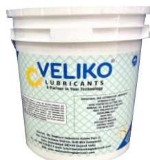
ALL TYPES OF OIL