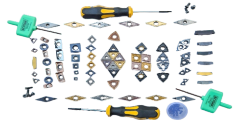
CNC/VMC INSERT & SPARES