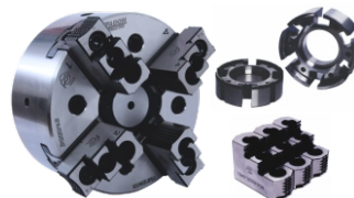
CHUCK & SPARES