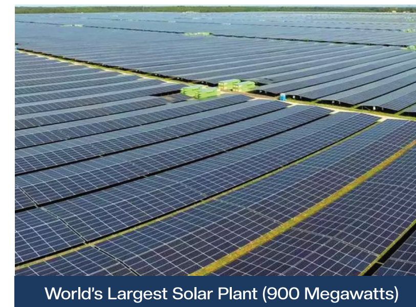
World's Largest Solar Plant (900 Megawatts)