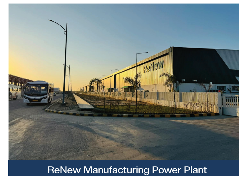
ReNew Manufacturing Power Plant