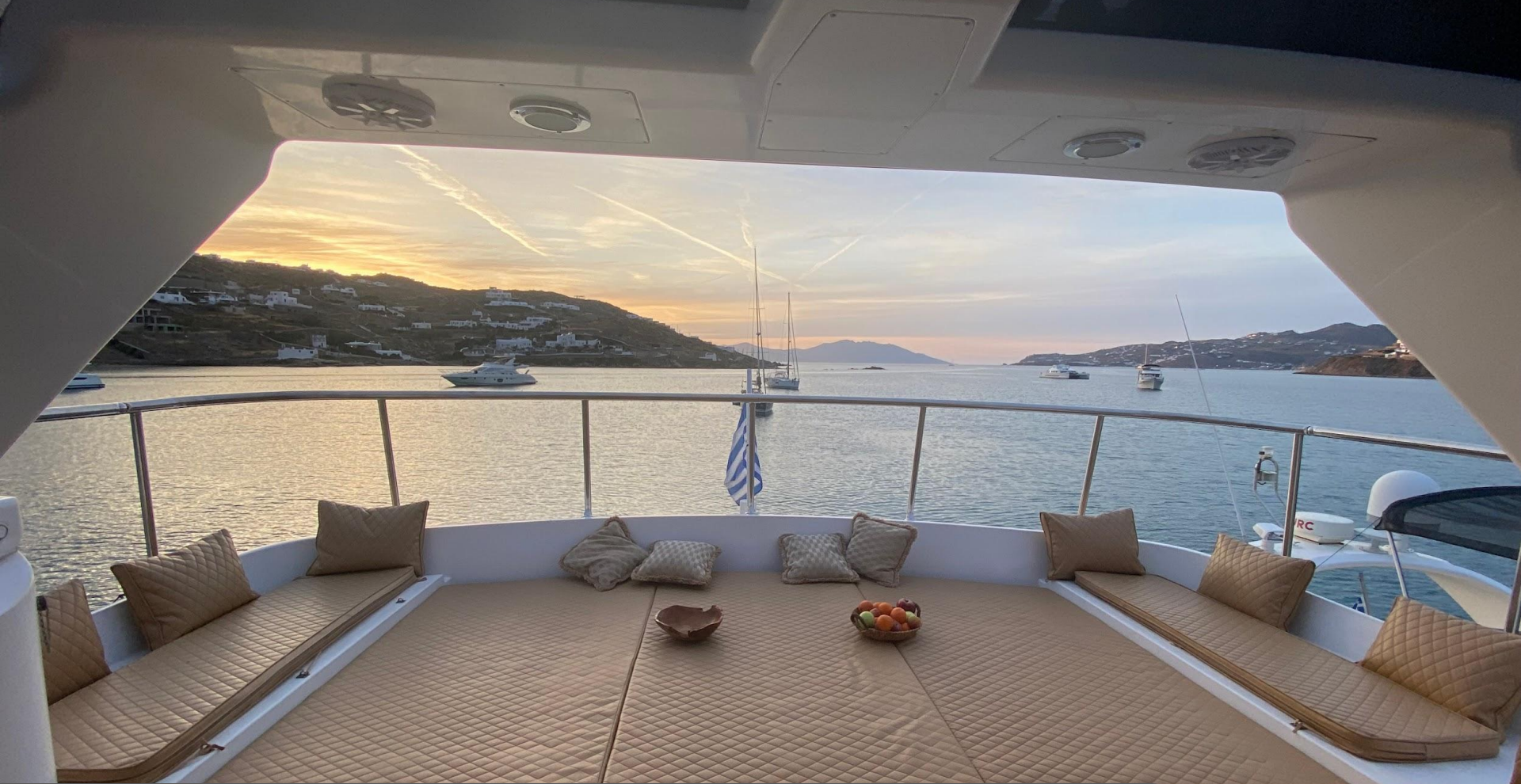
Catch the Island Sunset on the Superphantom 85