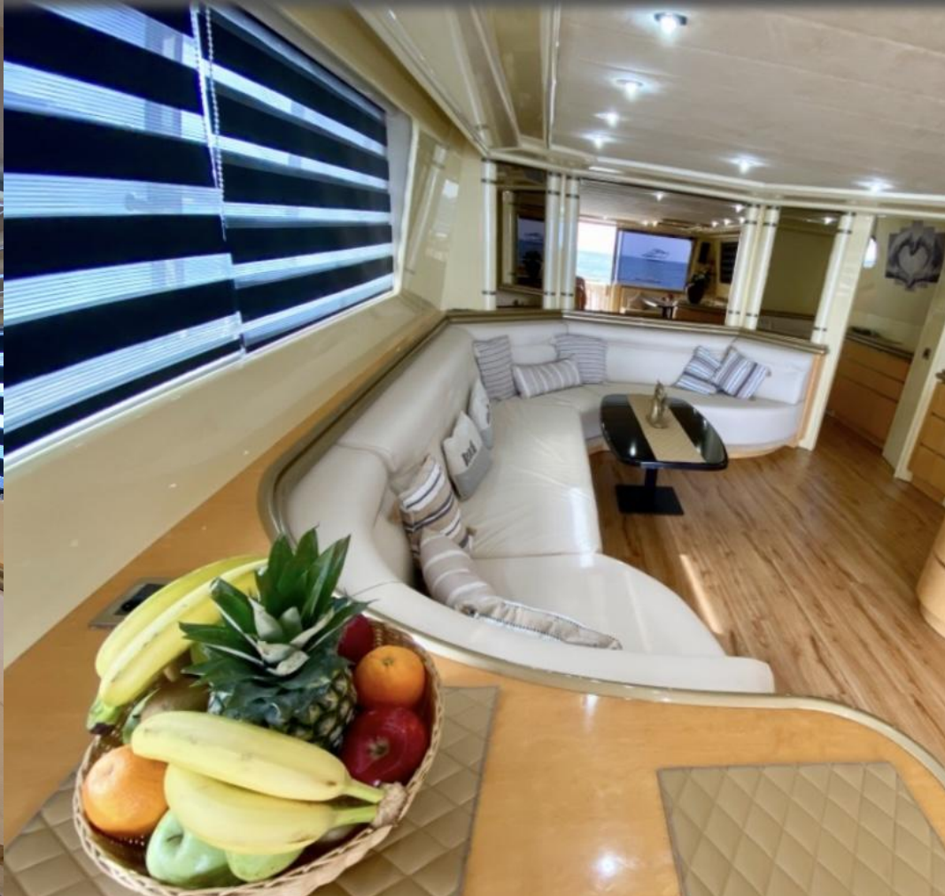
Rest, work, chat inside the Superphantom 85