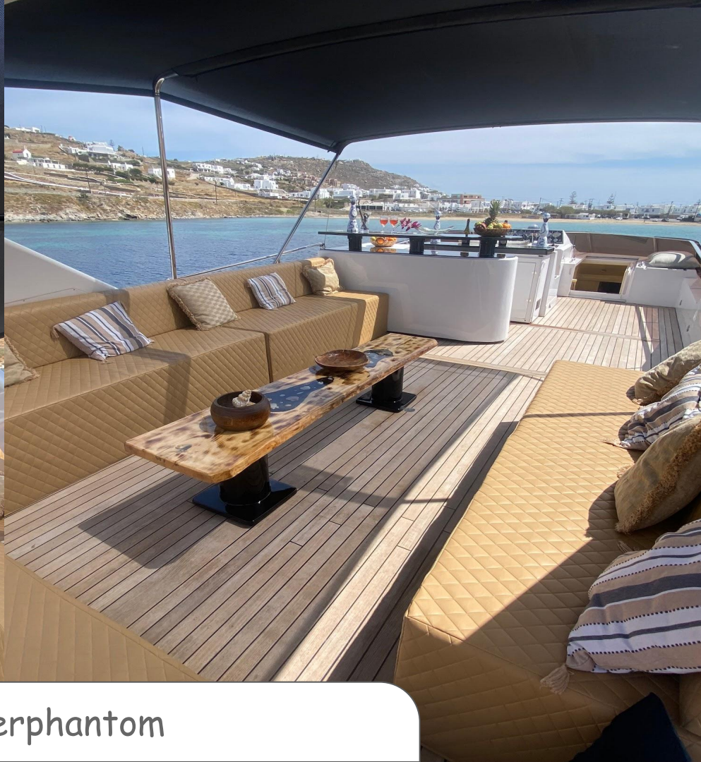
Seat,lay,play on the Superphantom