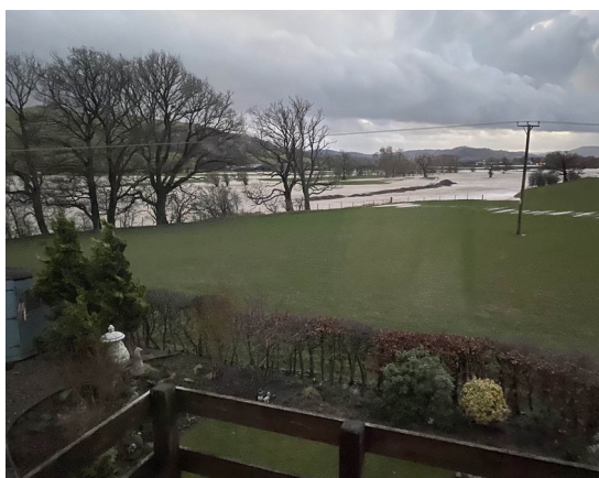
Severn Lake, Aberhafesp. February 2022 after the terrible storms.