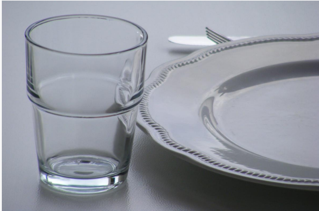
Glass cup and porcelain plate