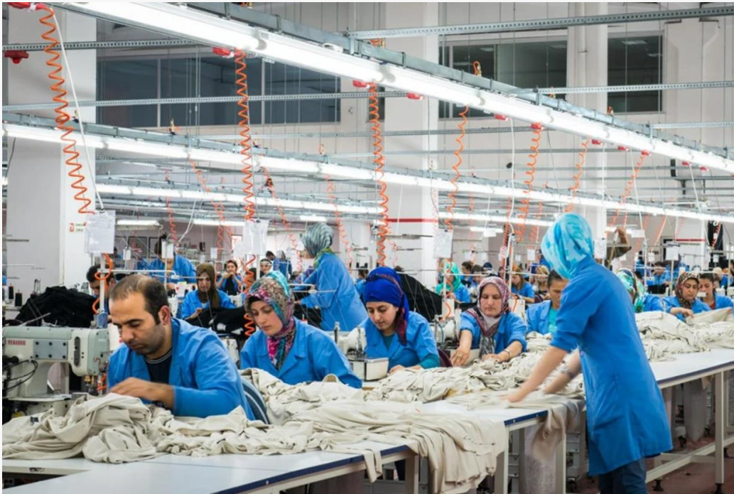
Workshops employing adult workers