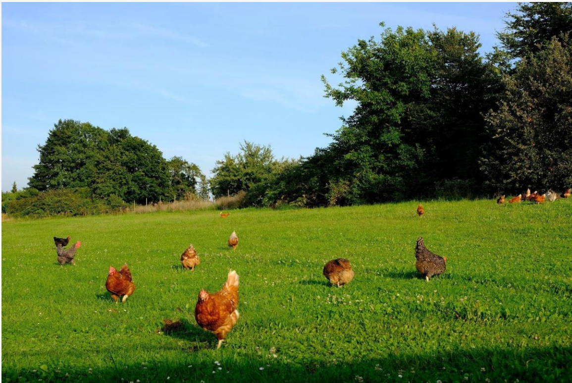
Chicken eggs living in their natural habitat