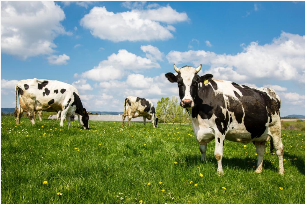
Milk from cows living in their natural habitat