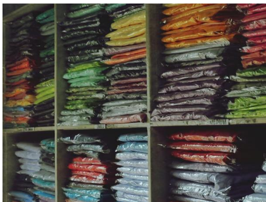
FACTORIES PRODUCE BIG QUANTITIES