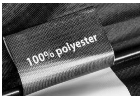
LOW QUALITY MATERIALS