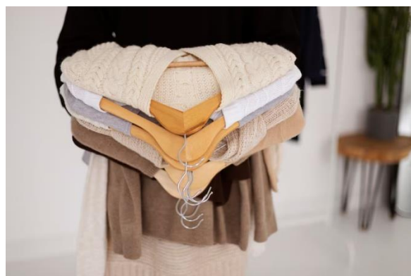
FACTORIES PRODUCE SMALL QUANTITIES