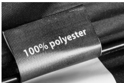
LOW QUALITY MATERIALS