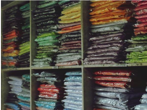
FACTORIES PRODUCE BIG QUANTITIES