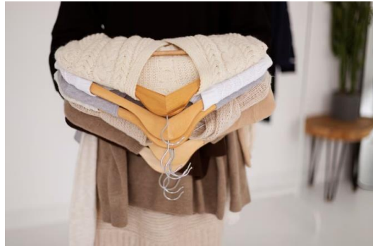
FACTORIES PRODUCE SMALL QUANTITIES