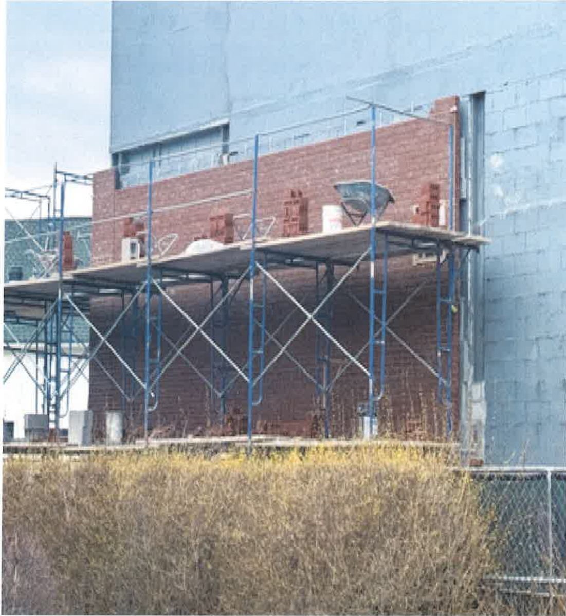
Exterior brick on NW side of building