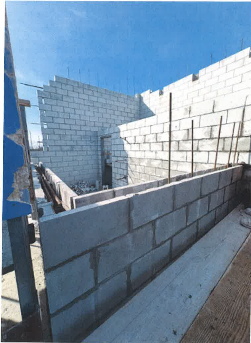
South Elevator Shaft