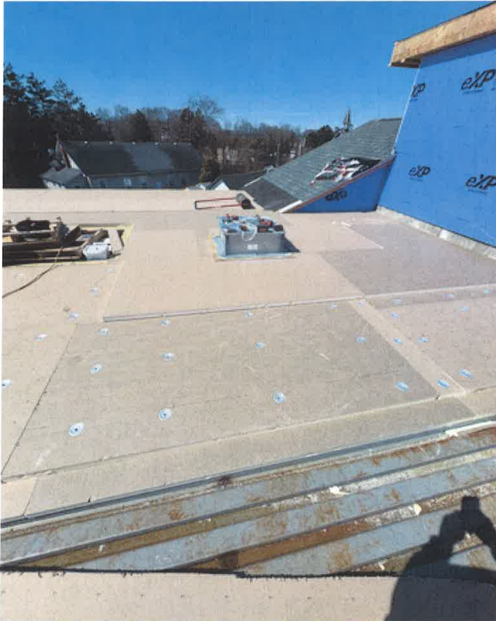
Flat roof insulation