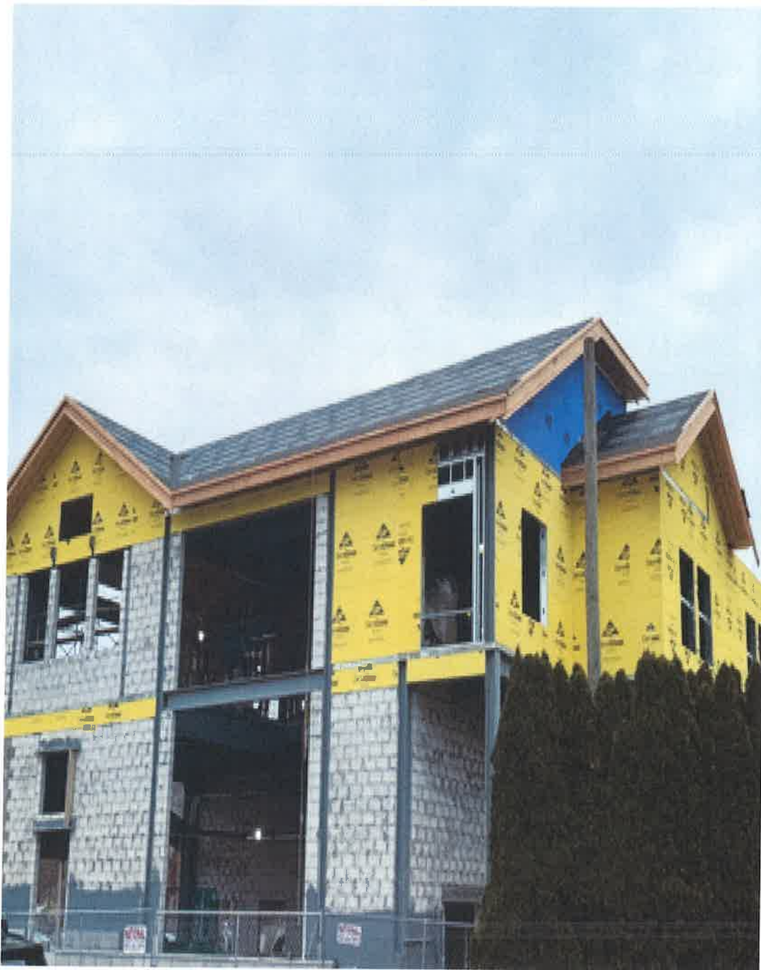
SIPs Panels & fascia complete, ice & water shield and tar paper on roof.