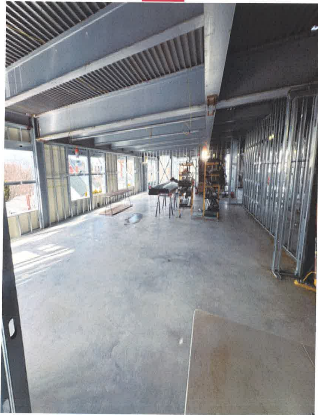
Community Gathering Room