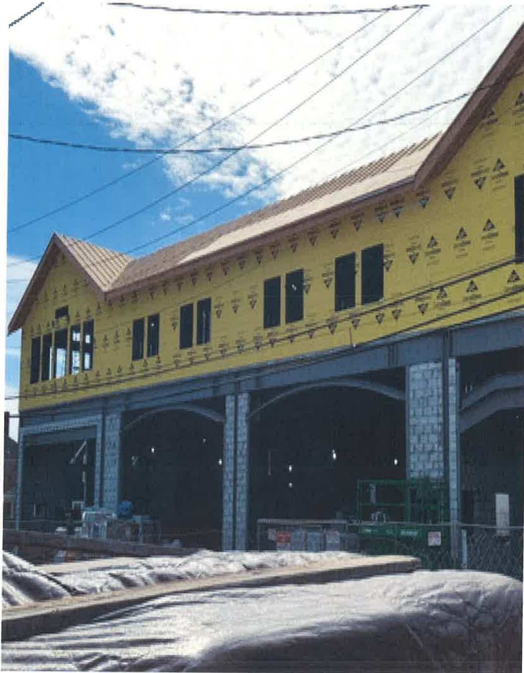
Roof framing on top of SIP panels