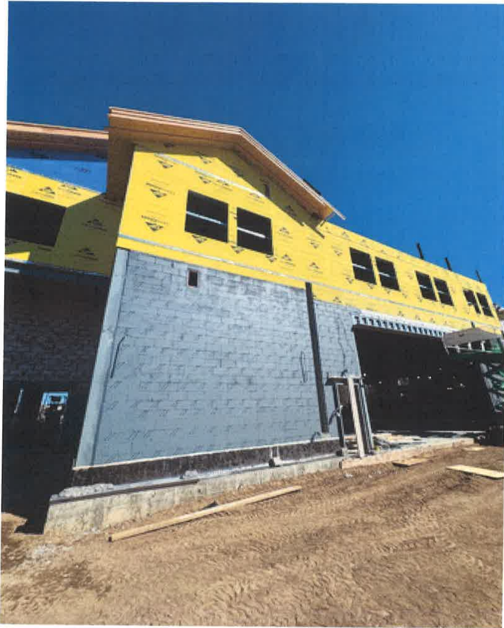
Waterproofing sealant, and flashing.