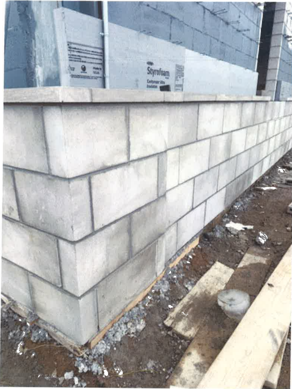
Arriscraft exterior base stone on North side of building.