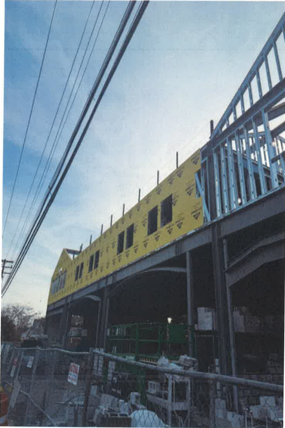
Sheathing and framing on 2nd Floor Front of Building