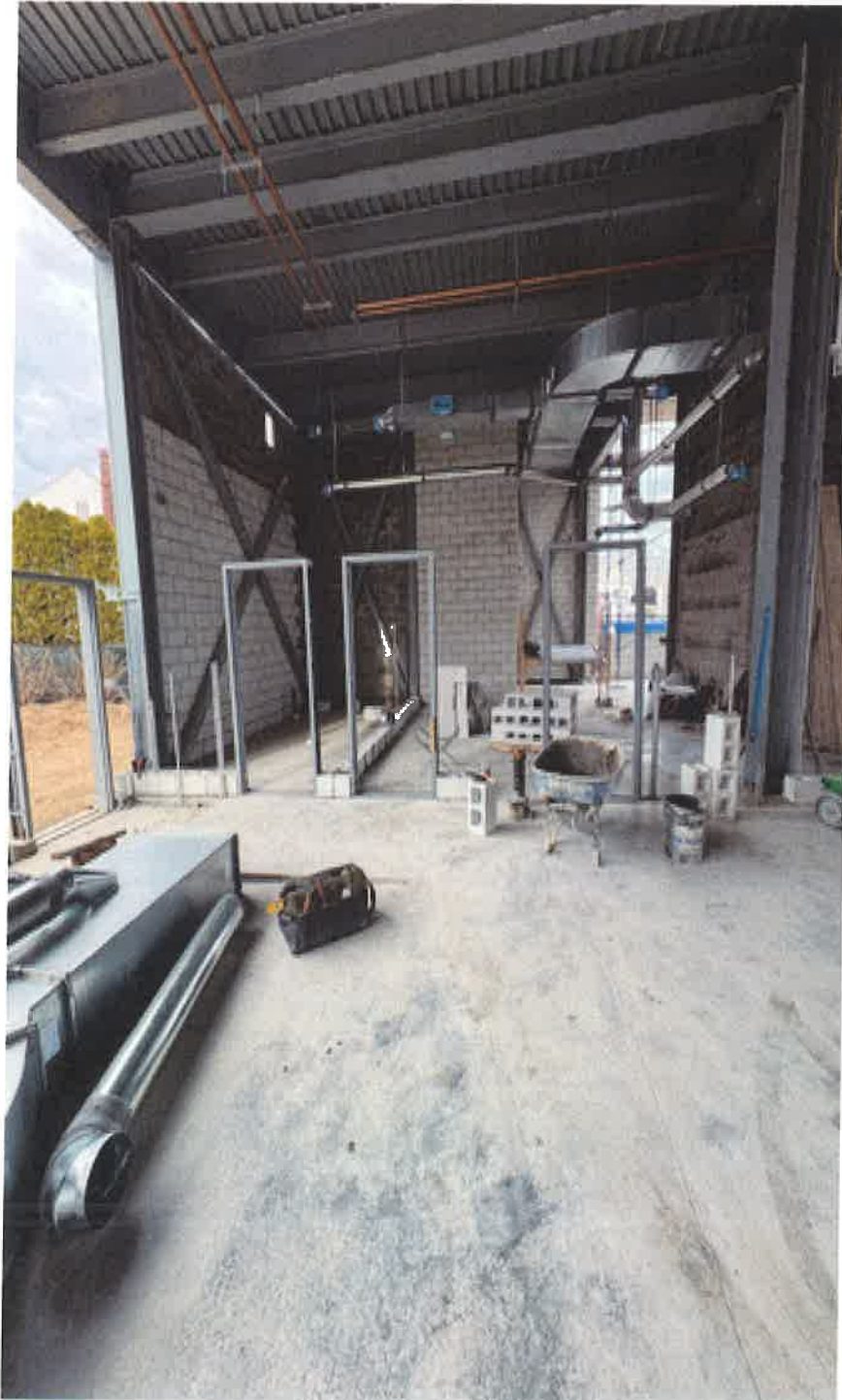
1 st Floor NW CMU Wall with New Ductwork and Door frames