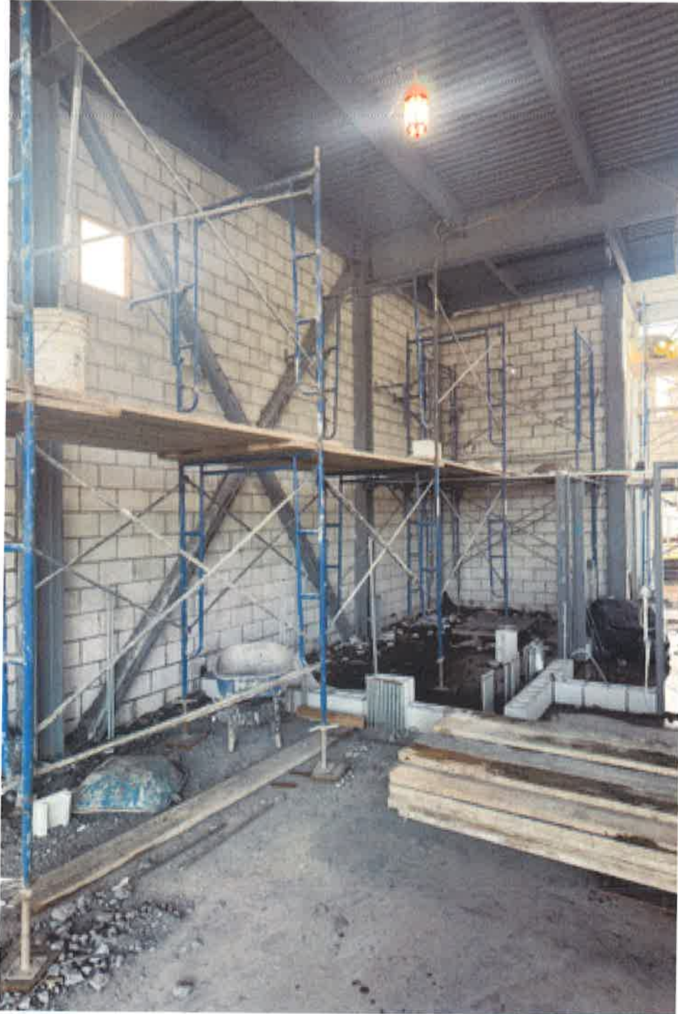
1 st Floor SW CMU Wall