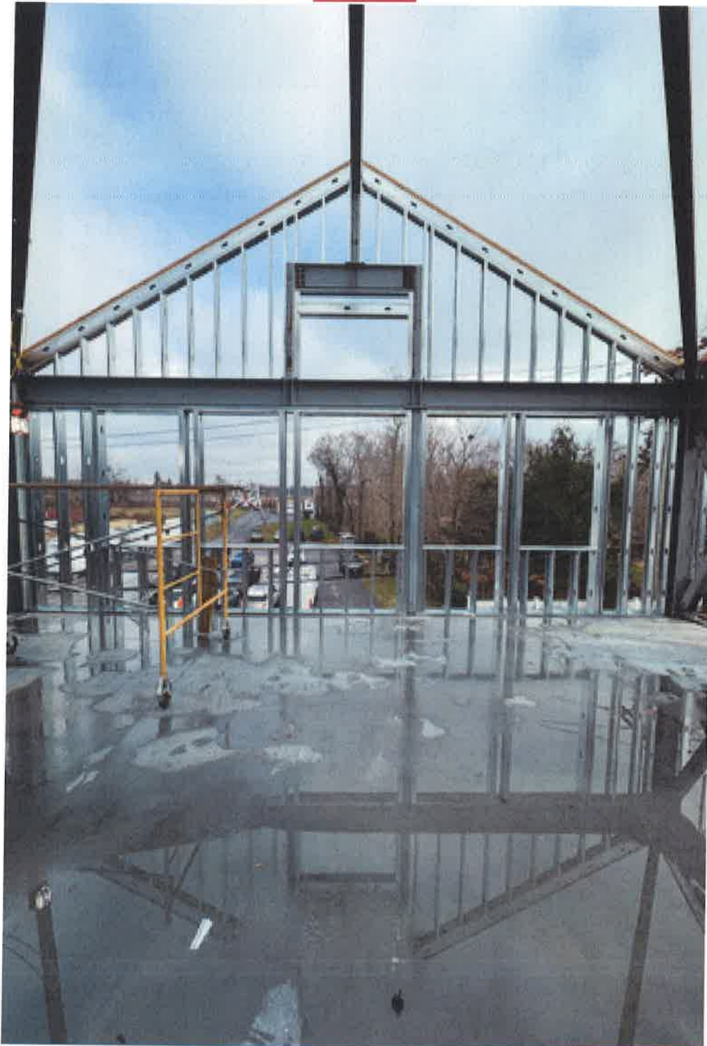
2 nd Floor SE Gable Framing