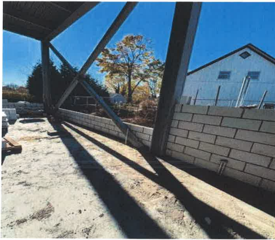
Roof blocking & West exterior block wall