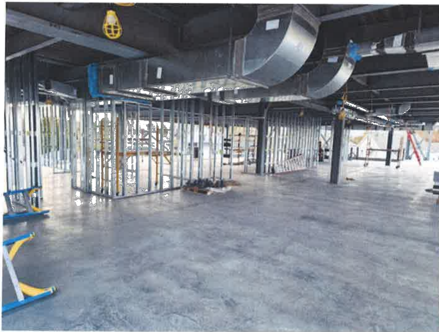
Finished first-floor concrete. Began framing and ductwork on 2 nd Floor