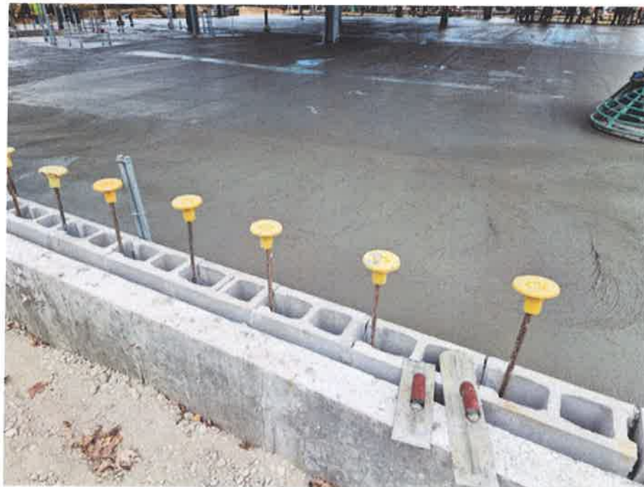
Pouring Concrete on 1 st floor