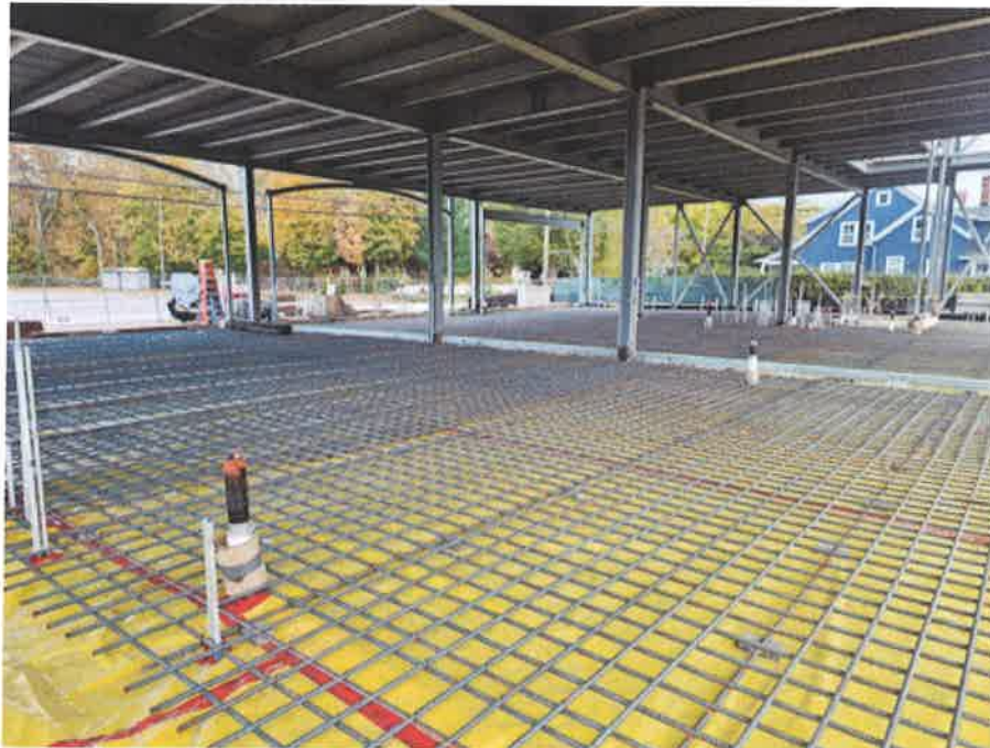
Rebar on 1 st Floor