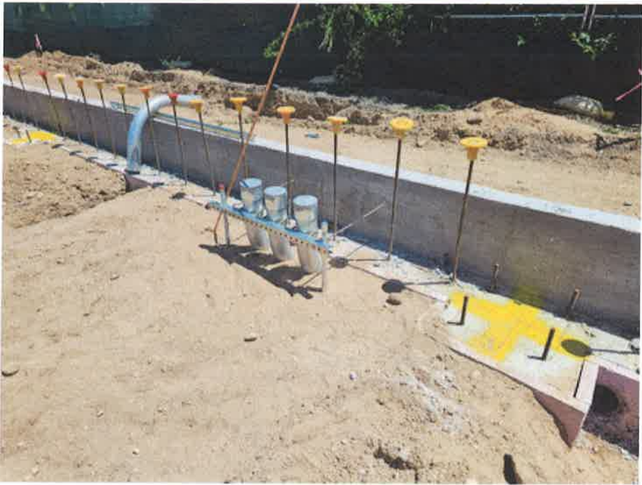
Foundation walls, backfilling, Underground MEP's