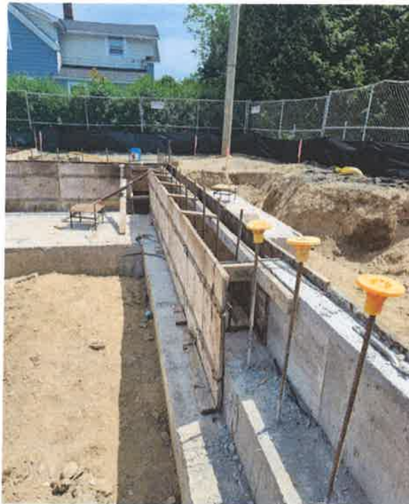
Formed and Poured Foundation walls