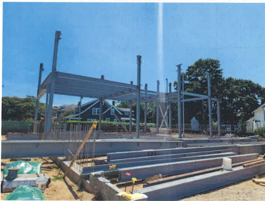
Steel Columns and Beams