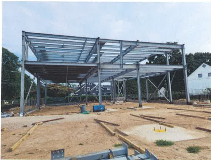
2 nd Story Steel Columns & Beams