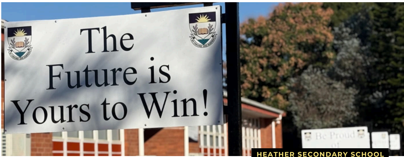
HEATHER SECONDARY SCHOOL