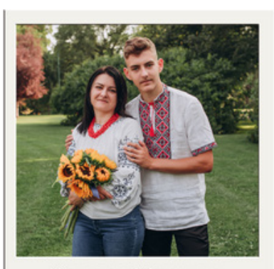
HOME IN WINNIPEG, AUGUST 2024