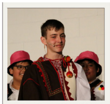
"THE GROOM", UKRAINIAN WEEK, MARCH 2023

Thanks to your generosity in 2023, students in grades 4 to 6 came Back to School, and new classroom furniture. The students say they enjoy having more desk space and more comfortable chairs.