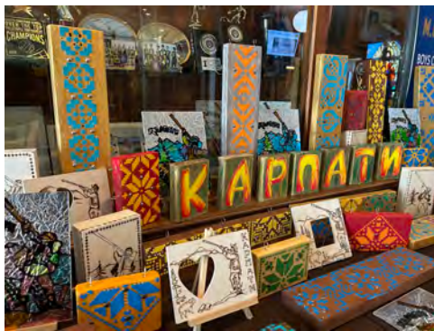
Beautiful Carpathian-inspired art projects

To complement the concert, each student participated in a Carpathian-themed art activity. Through traditional motifs and vibrant colours, students expressed their understanding and appreciation for the unique culture of the Carpathian region. These works of art now brighten each family's home, serving as a proud reminder of their learning journey.