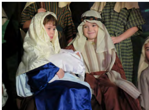
Students celebrate the Nativity in the K-3 Christmas concert

One of the year's most heartwarming moments came in December when our school hosted not just one, but two magical Christmas concerts. Each performance showcased our students' talents and hard work as they told the story of baby Jesus' birth. The energy, joy, and community spirit that filled the auditorium reminded us all of the importance of celebration and connection during this special season.