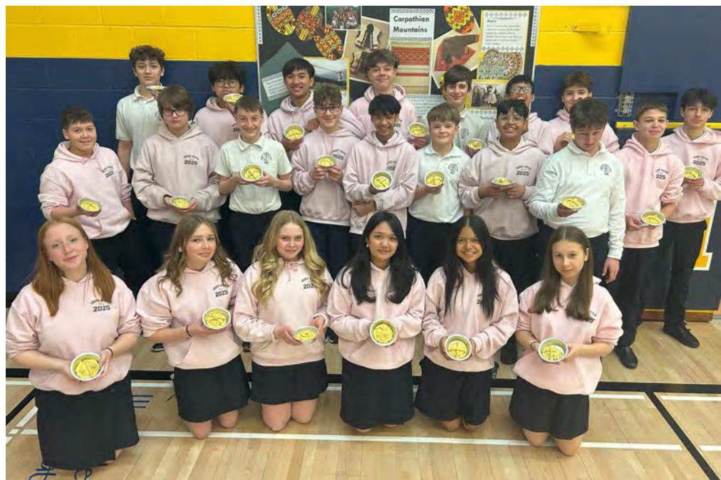
Welcome to our newest IHMS alumni, the 2025 graduates! We can't wait to see and hear about what you do next! God's blessings on you as you begin this new chapter.