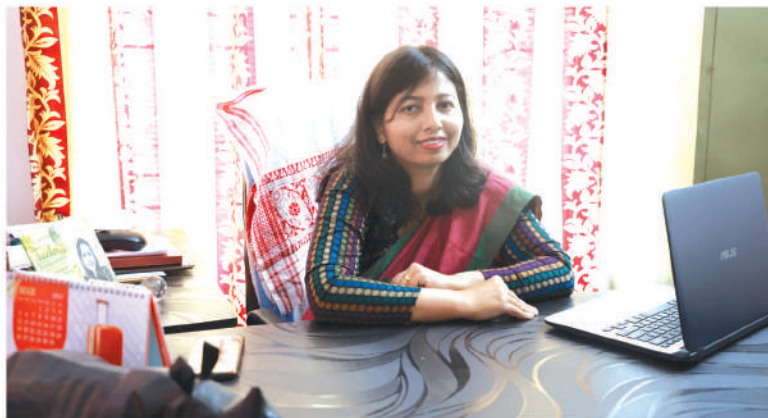
PRINCIPAL ASSAM PHARMACY INSTITUTE