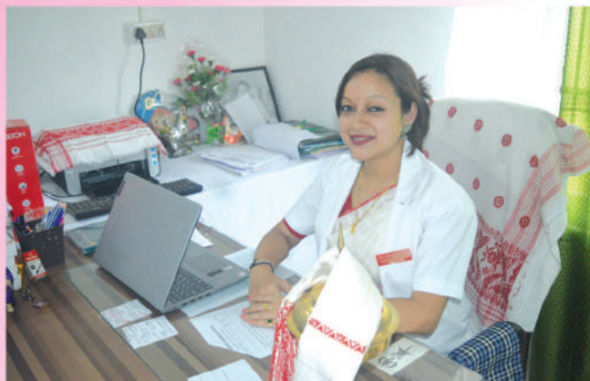
PRINCIPAL ASSAM NURSING INSTITUTE