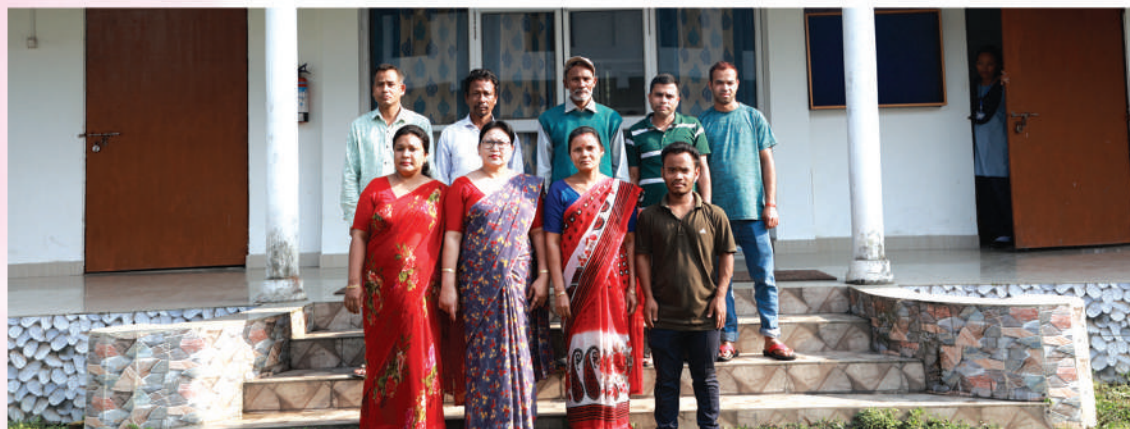
NON TEACHING STAFF