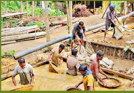
Gem Mine Visit