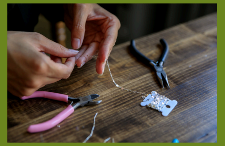
Jewelry Making Class