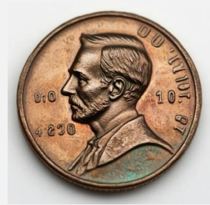
Quarter (25 cents)