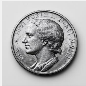
Penny (1 cent)

Carefully look at the coins and their values to understand how much each one is worth. After that, read the sentences provided below and use the information to calculate the total amount of money.