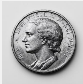
Dime (10 cents)