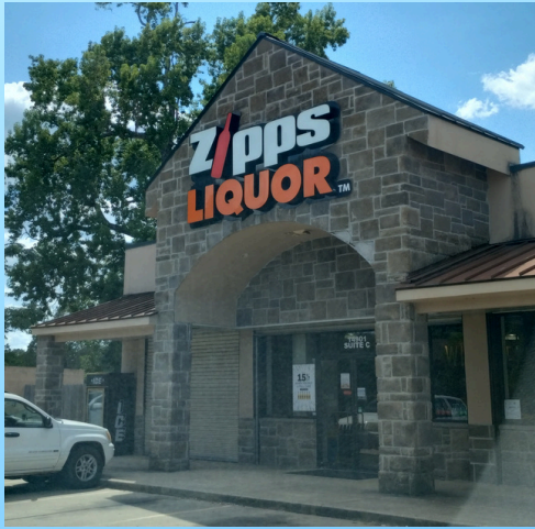
ZIPP'S Liquor Store 14901 TX-150, Coldspring, TX 77331