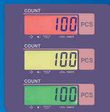
Three backlight colors