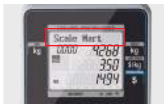
Scrolling Message Bar