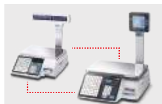
CL Series Compatible