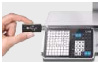
Firmware Update via USB Flash Drive