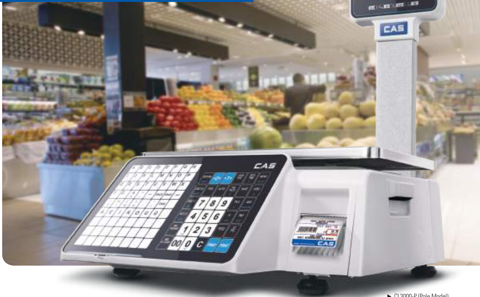
▶ CL3000-P (Pole Model)

The all new CL3000 Label Printing Scale.