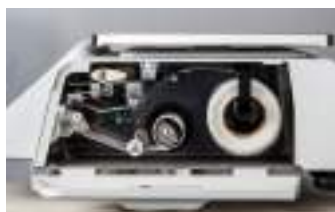
Optional Linerless Label Printing