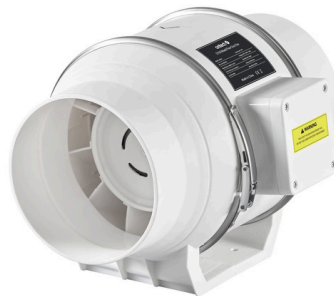
DUCT FAN (INLINE BLOWER)