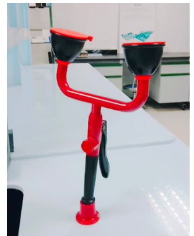
LABORATORY EYE WASH