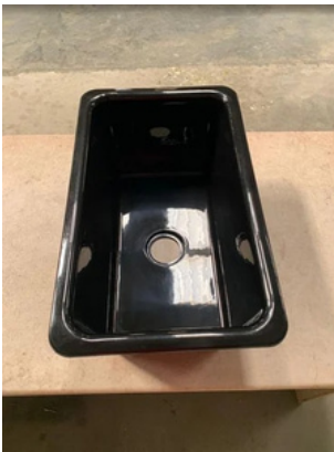
CHEMICAL RESISTANCE SINK