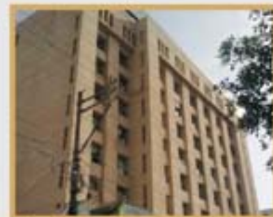
Business Centre Shahr-e-Faisal

Address: Suite #110, 1st, Floor, Business Arcade Shahrah-e-Faisal, Karachi.