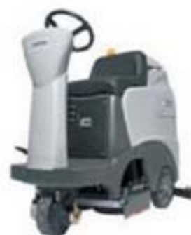
Ride on Scrubber Drier