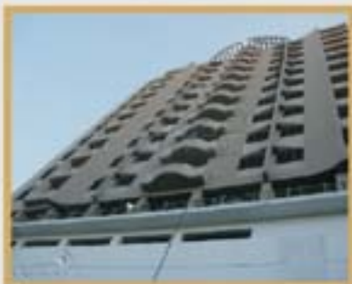
Saima Tower Johar Mor