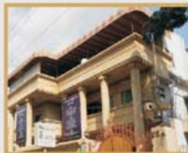
Tabani Academy Allah Wali Chorangi Nursery