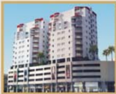
City Centre Mall & Tower Bahadurabad

High Building Glass Cleaning & Janitorial Contractor Floor Polish & Fumigation