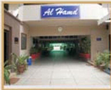
Al Hamd Academy Tariq Road