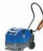
Scrubber Drier with Disc brush