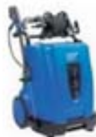
Hot & Cold Pressure Jet