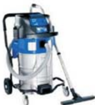
Wet & Dry Vacuum

Range of Cleaning Equipments with a wide bandwidth of cleaning capabilities