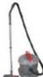
Silent Dry Vacuum