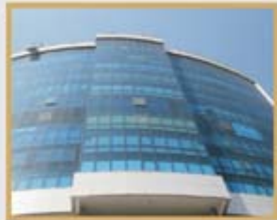
Dill Khusha Tariq Road