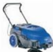
Walk behind sweeper