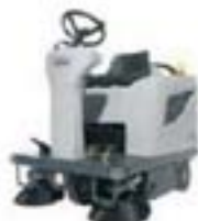
Ride on Sweeper