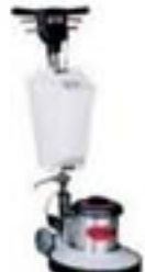
Single Disc Scrubber