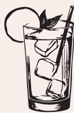
LONG ISLAND ICE TEA