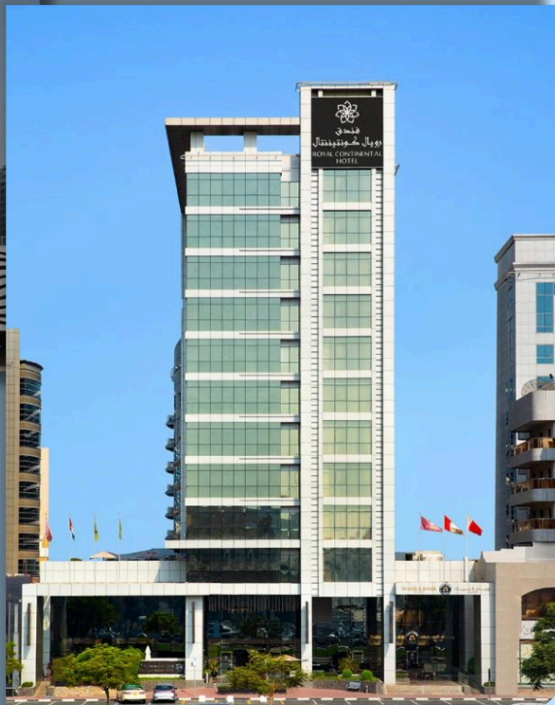
Royal Continental Hotel Deira, Dubai