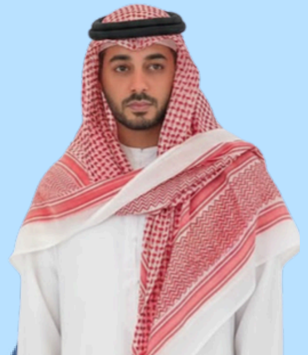
CFO & Board Member