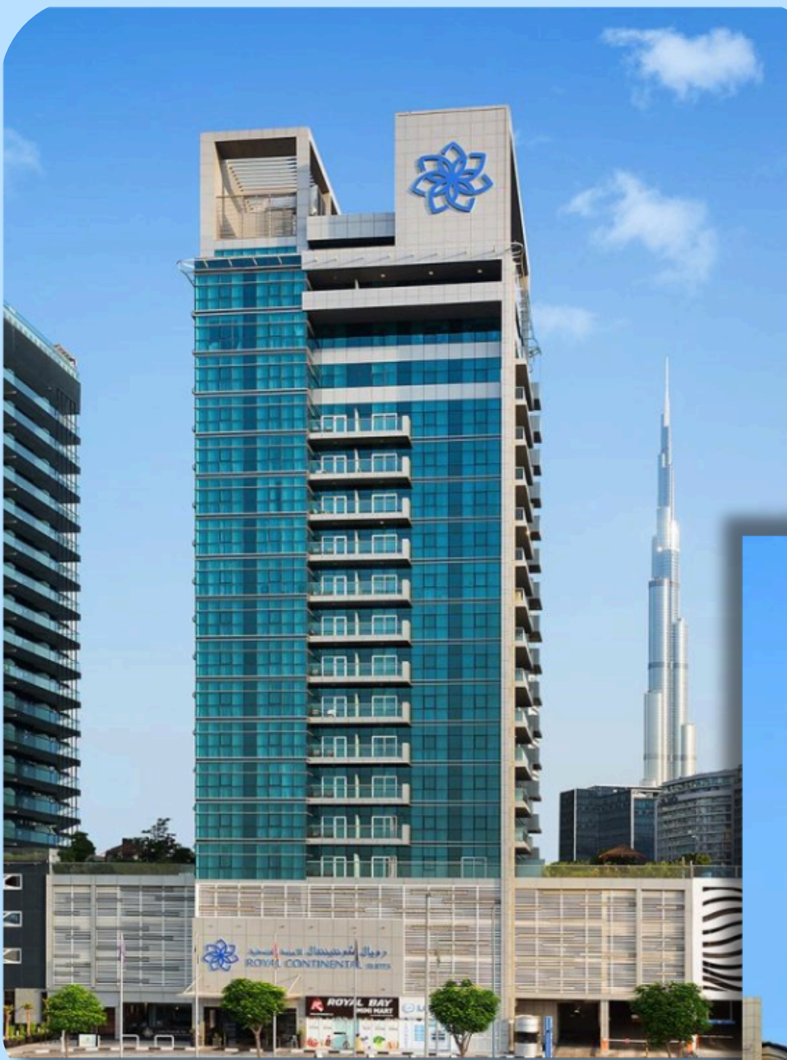
Royal Continental Suites Business Bay, Dubai

Located in two ideal locations, Royal Continental Hotel Deira City Center, a Dubai Airport Hotel, and Royal Continental Suites Business Bay at the strand of Dubai Canal and near Dubai Downtown, both offer business travelers and holidaymakers a stylish and welcoming stay experience. With a variety of rooms and suites to meet all requirements and tastes, as well as a host of business and leisure facilities, dining outlets, and amenities, Royal Continental Hotel and Suites provide the discerning traveler with impeccable accommodation and service in relaxed contemporary surroundings.