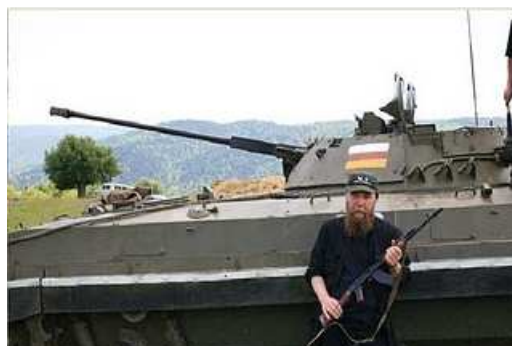
Mr. Aleksandr Dugin.

There are two questions: who are the actors in the world scene and what is the position of the United States in it?