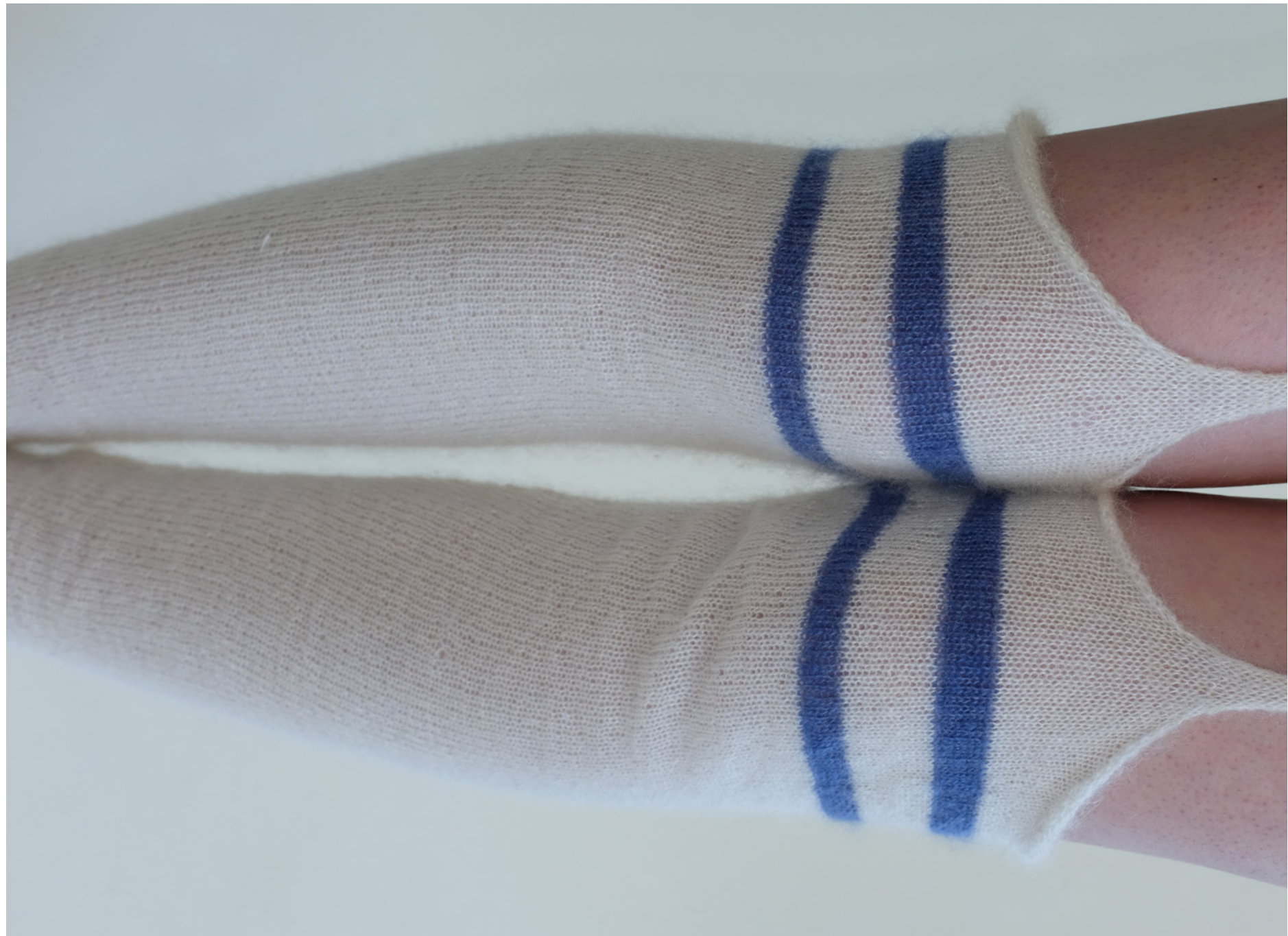
starched lace molded top made from hand-crocheted doilies / machine knit garter stockings