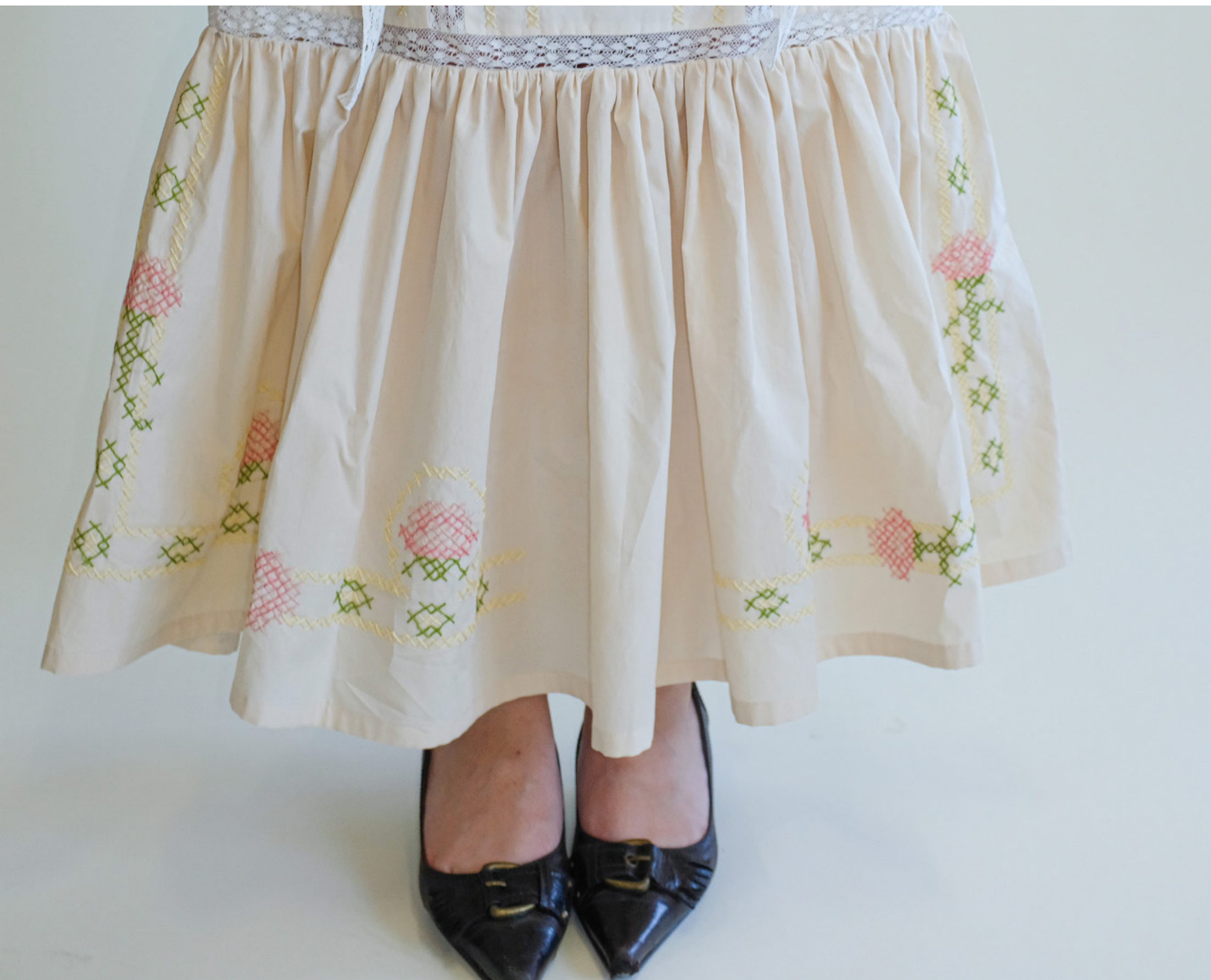
coffee-dyed cotton poplin skirt and corset garter set with hand embroidered cross stitching.