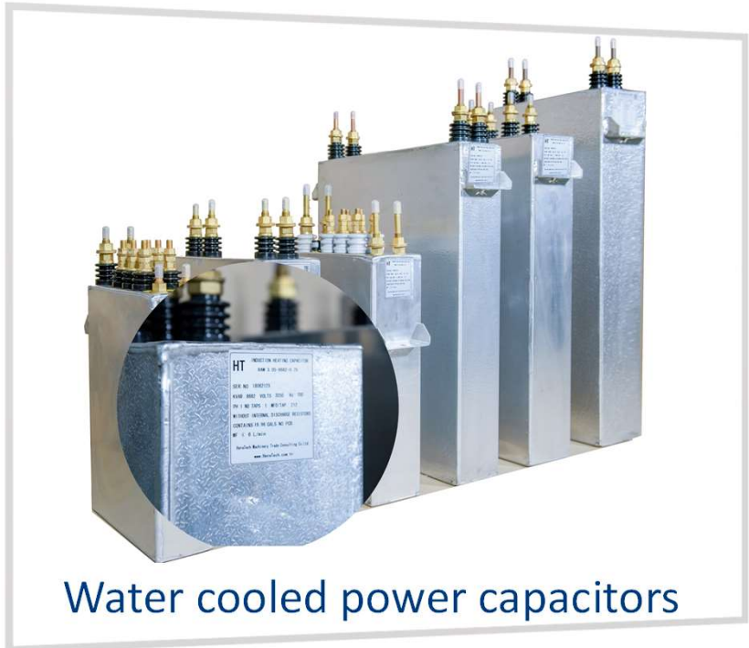
Water cooled power capacitors