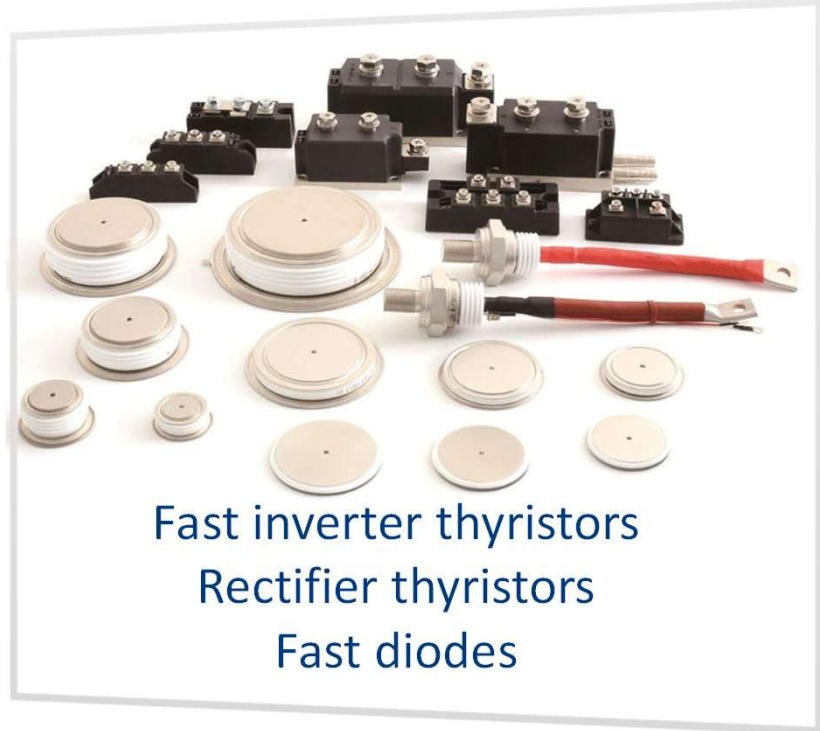
Fast inverter thyristors Rectifier thyristors Fast diodes