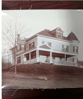
Louis Cutting House