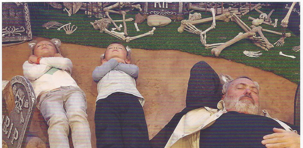
Great Wolf Lodge, 2019