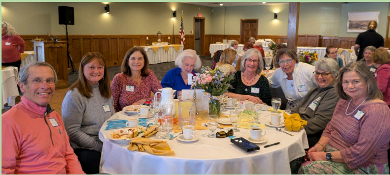
Warwick Garden Club