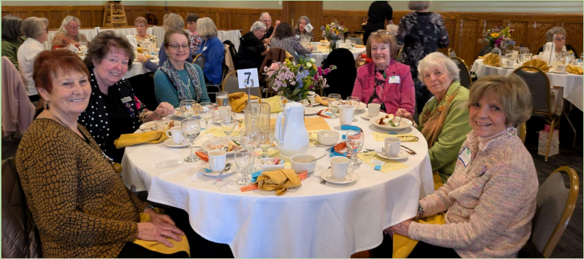
Pinebush & Clarkstown Garden Clubs