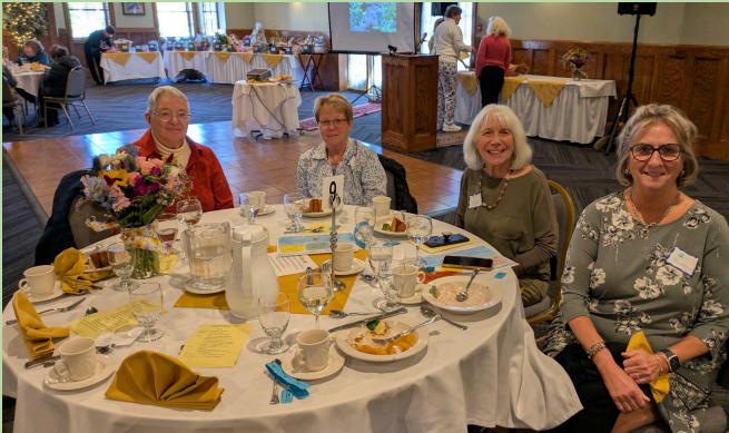
Garden Lovers' Club - Middletown

← DX 2025 Beautification Grant Recipients ↑