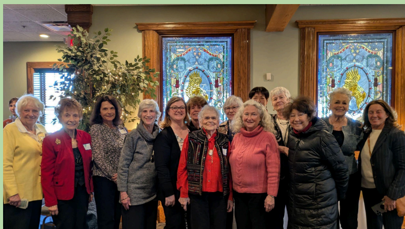
Community Garden Club of Liberty Members

Thank you again to the Community Garden Club of Liberty for a fabulous day!