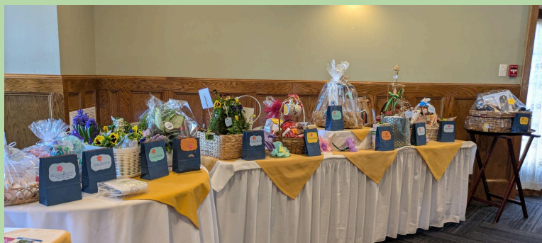
Just one of the raffle tables!