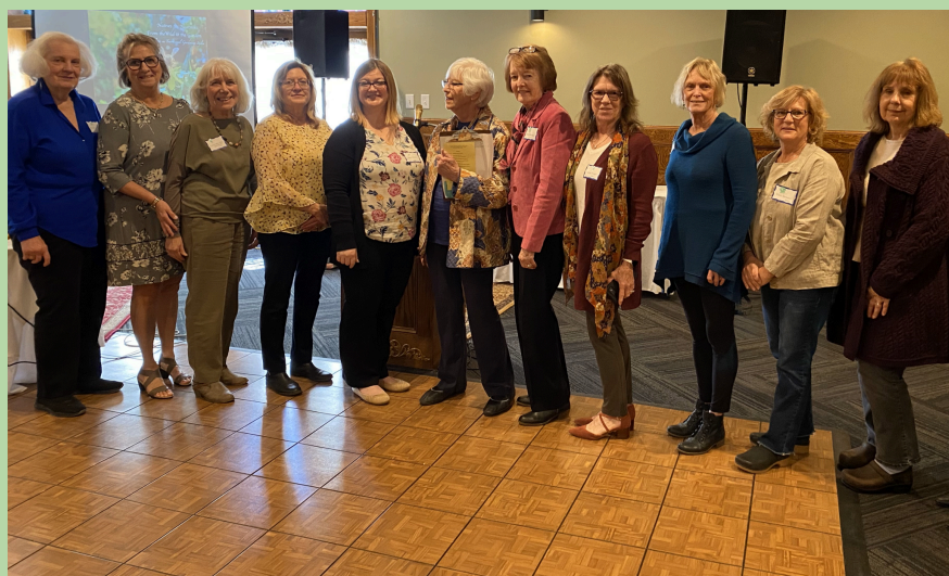
Incoming Presidents and Co Presidents from District X