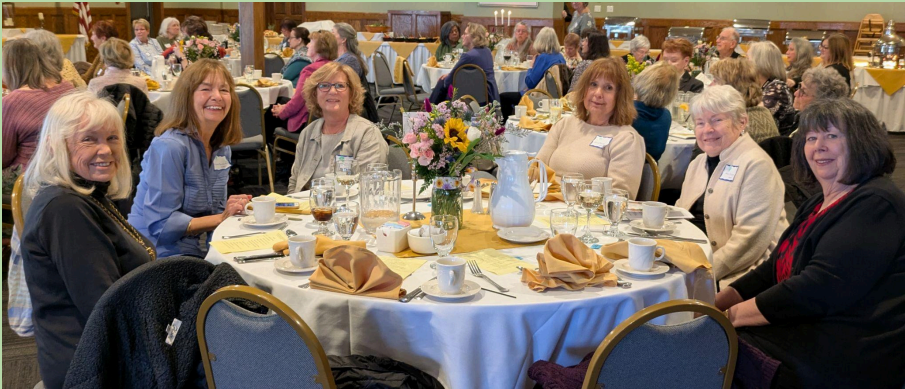
Cornwall Garden Club

← DX 2025 Beautification Grant Recipients ↑